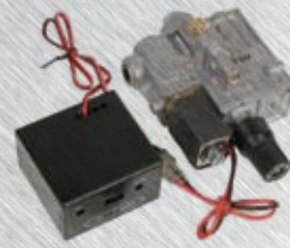
Switch/Remote Ready Control (RPK3E) Light burner with receiver switch or one of the five Wireless Transmitter Devices below. Adjust flame height by turning knob.