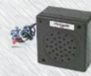
Crackler Fire Sound Generator. Includes RH2 (CF5SA1)