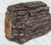
Ceramic Log House for all remote receivers (RH2)