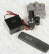
Variable Flame Height Remote Control (RMC1E) Light burner and adjust flame height by pushing button.

Upgrade to Remote Ready from Manual with item #SE-UP1