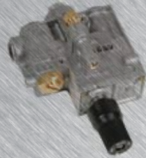
Manual Control (SPK3E) Light burner and adjust flame height by turning knob.

"EASY" Safety Pilot Lighting Controls The "EASY" system uses a common valve that offers many control options and the ability to upgrade functionality at any time (no need to replace the whole system). Controls provide convenient lighting as well as safety shut down in the event of an interruption in the gas supply or a flameout.