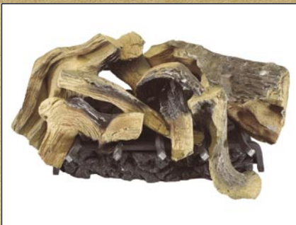
Solid, unitized log arrangement is intricately detailed.