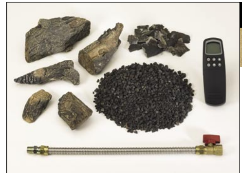
Standard feature components include hand-held, multi-function remote control